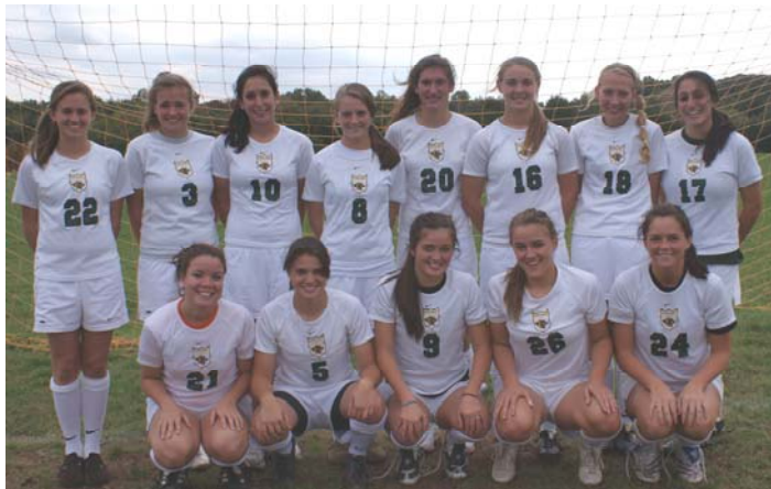
Seniors - Class of 2009